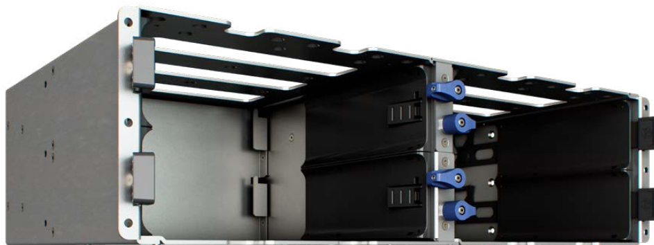
Figure 3 Voyager 4 Slim Side View