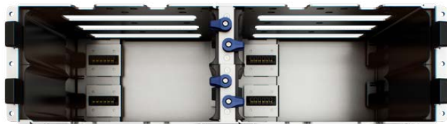
Figure 1 Voyager 4 Slim Front